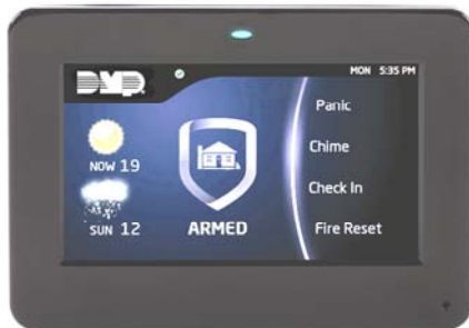
7800 Series Keypad

Enter the 5-digit U.S.A zip code where the panel is installed. When a zip code is entered the keypad status list will display the current temperature and conditions followed by the forecasted high temperature and conditions for the next day. To disable this feature, select any top row Select key and press CMD to clear the zip code display. The default is blank.