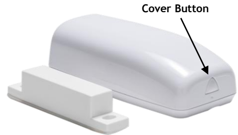
Figure 1: 1103 Universal Transmitter Housing

Standard software features remain the same, as well as the CR123 battery and terminal block for wiring to an external contact or switch.