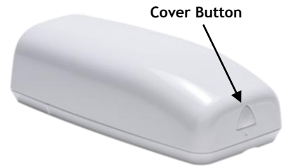
Figure 1: 1102 Universal Transmitter Housing

Standard software features remain the same, as well as the CR123 battery and terminal block for wiring to an external contact or switch.