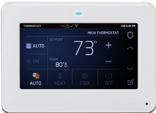
7872-W | 7873-W | 9862-W | 9862USB-W