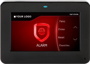
7872-B | 7873-B | 9862-B | 9862USB-B