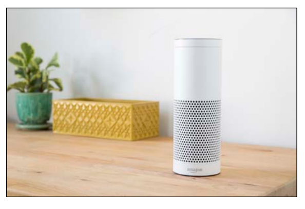
Figure 1: Amazon Echo

Then, search for the Virtual Keypad skill and enable it. Use your Virtual Keypad email and password to log in and select the system you would like to control.