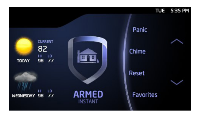
Figure 1: Instant Arming