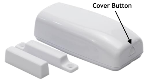
Figure 1: 1101 Universal Transmitter Case Design

Standard software features remain the same, as well as the CR123 battery and terminal block for wiring to an external contact or switch.