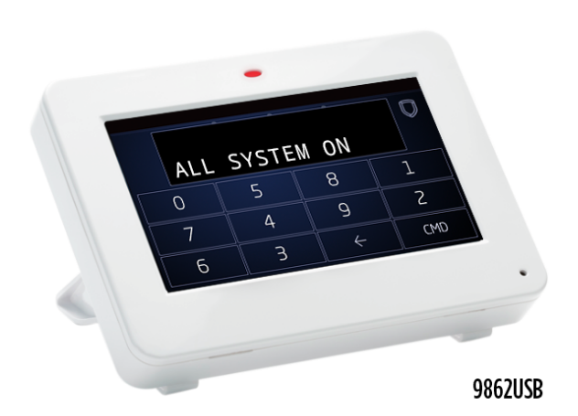
USB style includes desk stand and easy-to-plug-in mini-USB power supply.