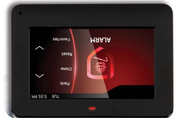
Graphic Touchscreen Keypad

Keypad lighting illuminates red during an alarm and remains red, so you can instantly see that an alarm has occurred while you were out.