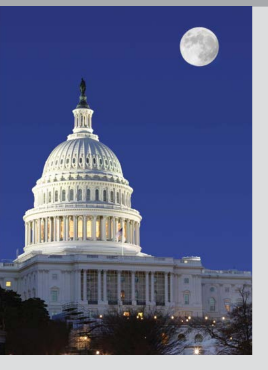
MADE, TESTED AND QUALITY INSPECTED IN THE U.S., OUR PRODUCTS MEET THE HIGHEST STANDARDS IN THE SECURITY INDUSTRY.